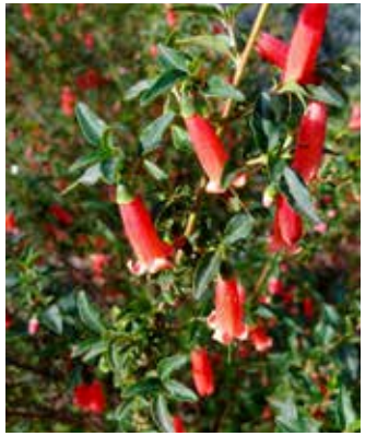
Acacia beckleri, Correa pulchella & Eremophila 'Fairy Floss' maculata X racemosa - all growing and flowering well with twice yearly doses of Neutrog's Bush Tucker. Images of Winter Flowers in Miriam's Hurstbridge Garden